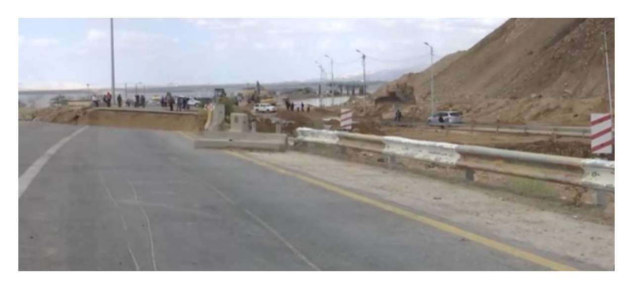
Almost a month later on Nov. 18th a landslide swept part of an ongoing Dead Sea Beach 32 M$ project with an estimated damage of about 350,000 $.