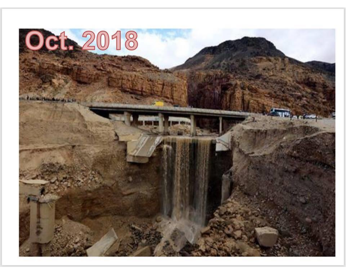
A partially damaged bridge which lost one of its pillars in Oct. 2017 leading to its partial closer. It totally collapsed on the 25th of Oct. 2018.