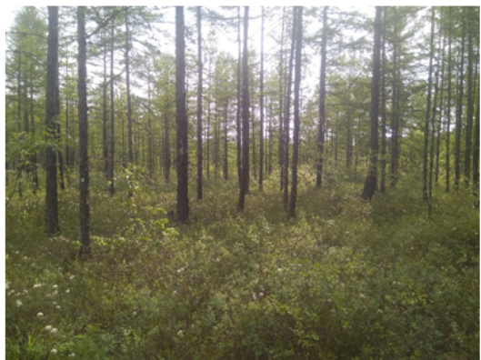
(a) LL swamp forest