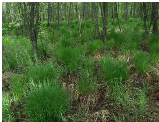
(b) LC swamp forest